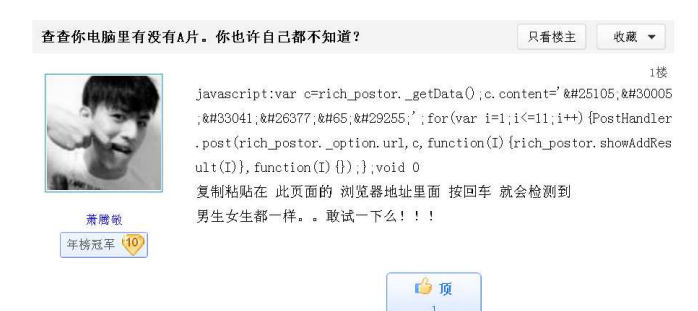
Fig. 2. Screen Shot of the Motivating Example (We show an English translation of this example in Figure 3.)